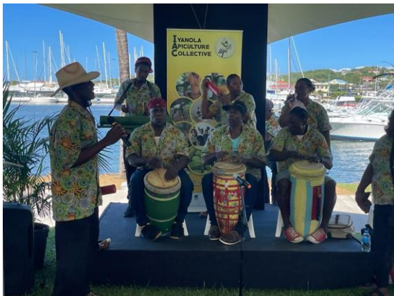
Figure 3: Solo Band "Campeche".

The opening ceremony was sounded off with vibrant melodies of creole voices and African drums of the authentic Saint Lucia genre of "Solo Music" from the group "Campeche". Visitors, dignitaries, and locals alike bobbed their heads to exotic mystical rhythms. Master of ceremonies quickly settled the audience and the programme swung into gear.